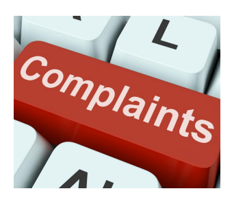
General Complaints Process

The Town of Happy Valley-Goose Bay has an official complaints process in effect which not only describes in detail the process for filing a complaint but also allows the Town to respond in the most efficient manner.