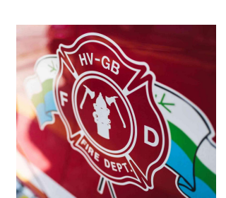
HVGB Volunteer Fire Department

The Town of Happy Valley-Goose Bay is fortunate to have a very active and dedicated group of Volunteer Fire Fighters. Why not follow them on their Facebook Page.